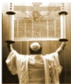
Revealed in Torah

"Behold, the days come, saith the LORD, that I will make a new covenant ( B'rit Chadashah ) with the house of Israel, and with the house of Judah: Not according to the covenant that I made with their fathers in the day that I took them by the hand to bring them out of the land of Egypt; which my covenant they brake, although I was an husband unto them, saith the LORD: But this shall be the covenant that I will make with the house of Israel; After those days, saith the LORD, I will put my law ( Torah ) in their inward parts, and write it (the Torah ) in their hearts; and will be their God, and they shall be my people. And no longer shall each one teach his neighbor and each his brother, saying, 'Know the LORD,' for they shall all know me, from the least of them to the greatest, declares the LORD. For I will forgive their iniquity, and I will remember their sin no more." (Jeremiah 31:31-34)