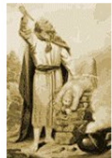
Jewish tradition says that Isaac was 37 years old at the time of the binding...

The first occurrence of the word “love” in the Scriptures refers to a father’s love for his “only” son who was offered as a sacrifice on Moriah, the place of the crucifixion of Yeshua.