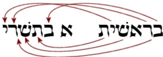
on the 1st of Tishri

The Mishnah (Sanhedrin 38b) states that Adam and Chavah were created on Rosh Hashanah (i.e., Tishri 1). But how did the sages determine this date? By transposing the Hebrew letters of the very first word of the Hebrew Scriptures: