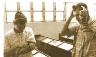
Tefillin shel Yad and Tefillin shel Rosh