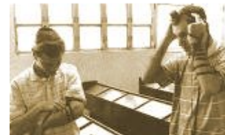
Tefillin shel Yad and Tefillin shel Rosh